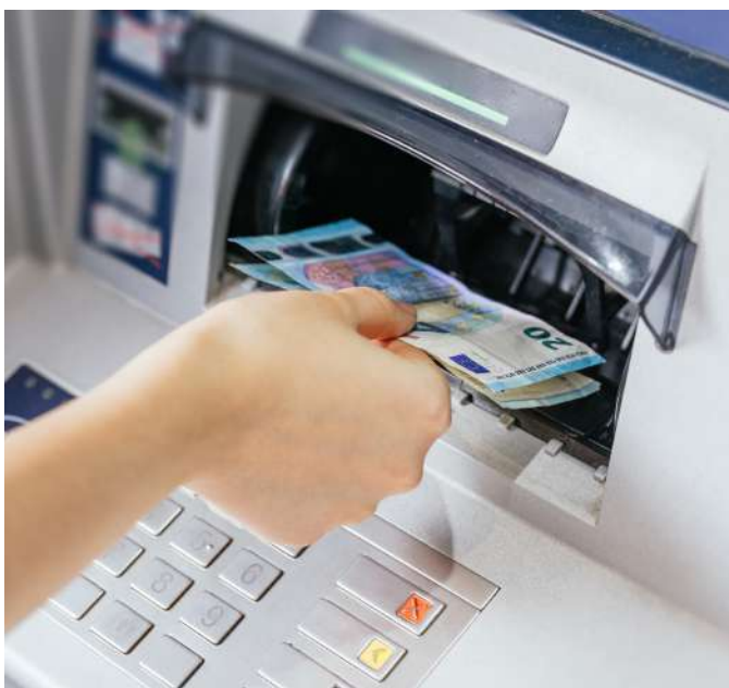
glair INK enables a smooth authentication of notes by vending machines.

Our state-of-the-art solution, glair STN , strongly enhances the availability of a wide variety of colour shades for IR visibility and IR-splits. The inherent compatibility with existing detection infrastructure like ATMs and vending machines ensures that glair STN seamlessly integrates as a cost-effective solution for your needs.