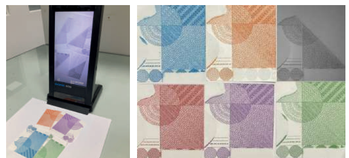
IR-detector and IRA/T pair of inks